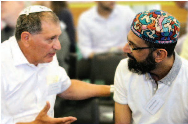
‘Dialogue on the Spot’ at IFN National Meeting