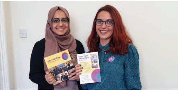
IFN Inter Faith Week interns